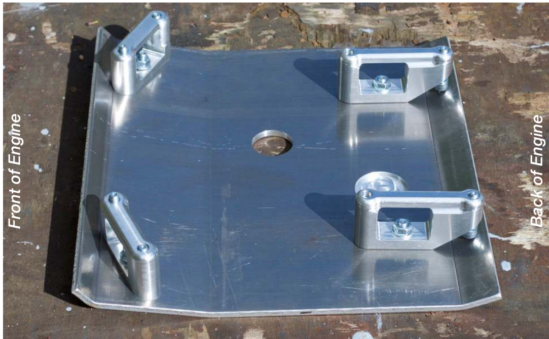
Picture shows the mounting block locations